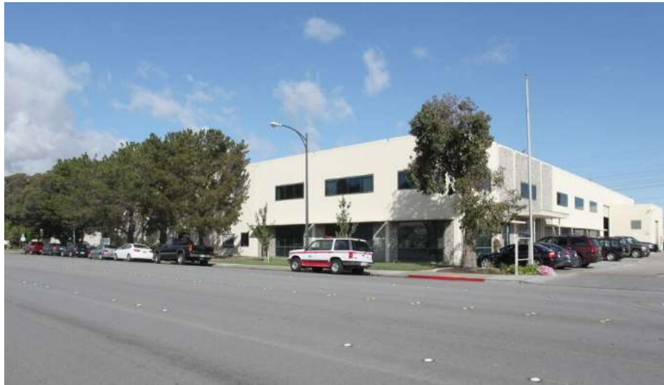
20 (AMR San Mateo Headquarters at 1510 Rollins Road, Burlingame, California) 5

10 13. AMR-West contracts with the County of San Mateo to provide ambulance services 11 to county residents such as Jane Doe. 4