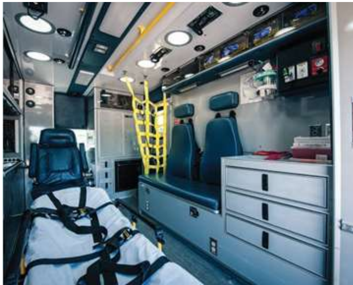
16 (Image available through https://www.amr.net , showing three seatbelt system in AMR ambulance)