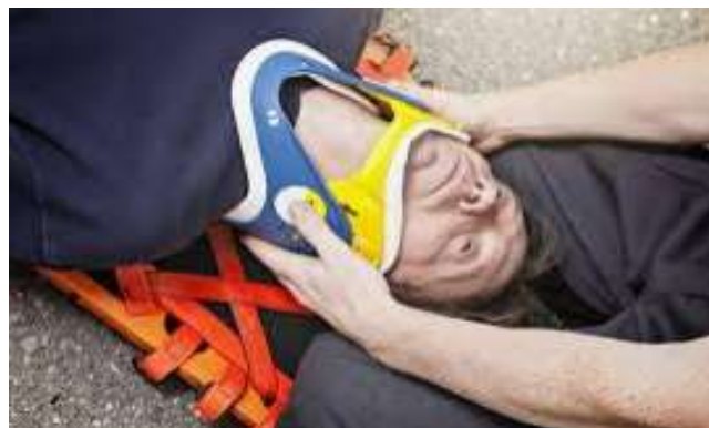
23 (Example of c-collar immobilizer)