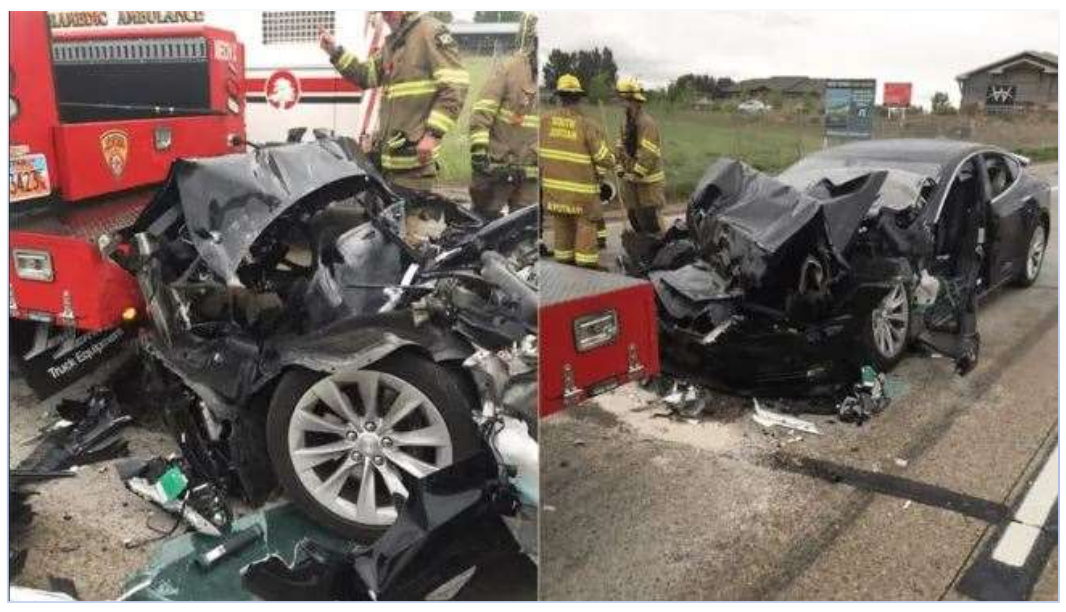
2018 crash in which Tesla's software crashed the vehicle into the back of a firetruck stopped at a red light in Utah.