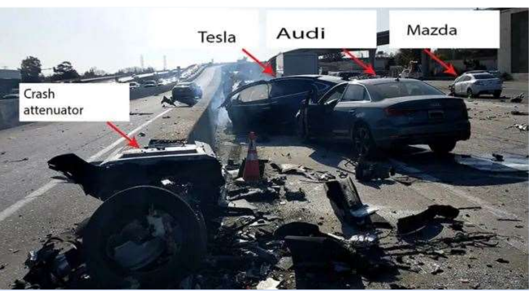
Fatal 2018 crash involving Autopilot, in which Tesla's software suddenly steered the Tesla to the left, directly into a concrete barrier on a highway in Mountain View, California.

myriad problems, such as cars failing to make routine turns, running red lights, and steering directly into large objects and oncoming traffic. <sup>1</sup> There have also been numerous collisions involving Tesla's purportedly cutting-edge ADAS software, including Tesla vehicles plowing at high speeds into large stationary objects such as emergency vehicles and an overturned box truck. Dozens of people have suffered fatal and other serious injuries as a result of these ADAS-related collisions, triggering a host of investigations by state and federal regulators.