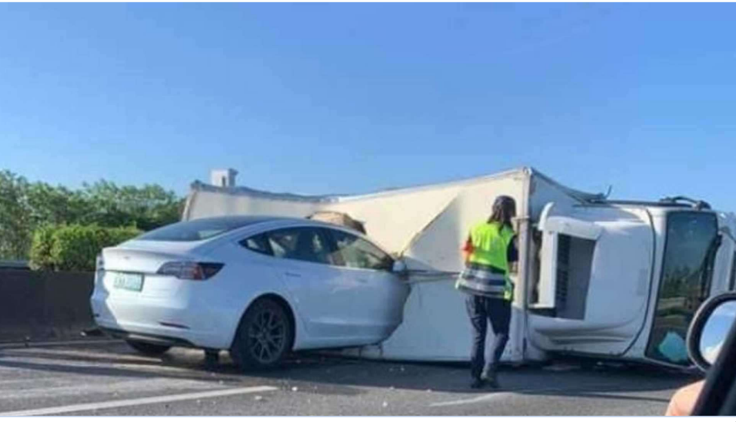
2020 crash involving Autopilot, in which the Tesla drove into an overturned box truck on a highway in Taiwan.<sup>2</sup>