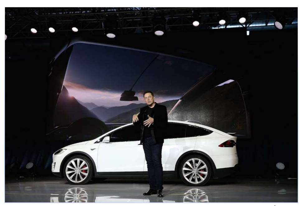
Musk making bold promises in 2016.<sup>4</sup>

7. From approximately 2017 to 2019, the page on Tesla's website explaining its "Full Self-Driving Capability" technology similarly promised that consumers who purchased or leased cars with the FSD version of its ADAS technology would receive cars capable of "full self-driving in almost all circumstances," including being able to "conduct short and long distance trips with no action required by the person in the driver's seat" and with a "probability of safety at least twice as good as the average human driver." On the same webpage, Tesla went on to state: