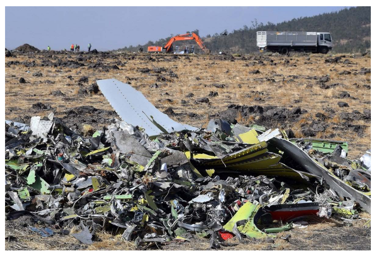
The Wreckage of Ethiopian Airlines Flight 302