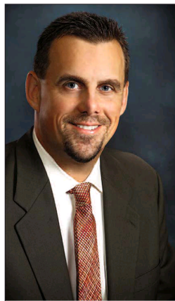
COTCHETT PITRE & McCARTHY LLP